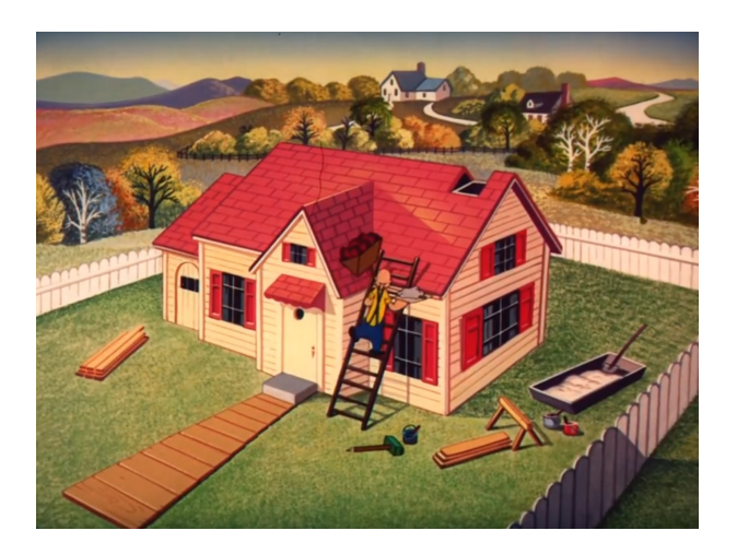
Fig. 3. An example movie scene.

scene by the subjects with ignoring trivial difference of words. Rather, the authors focused on difference of meanings.