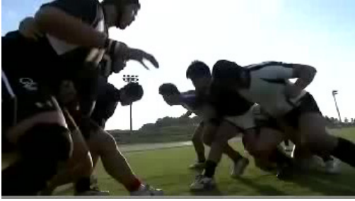
Fig. 2. An Example Movie Scene

of Verbert’s framework and the aspects of the presented object-oriented context model. The aspects of both context models have one-to-one correspondence, however,