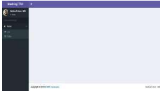
Figure 2. Main Menu Display

In this main Menu Display, if the participant is a pre-marital course participant, a pre-marital course guide or tutorial will be shown containing all material in accordance with the syllabus or curriculum. In this view, it will be equipped with a video animation of a marriage flow chart and reproductive health animation, the material of which works with the health center or health institution. In this main menu, a futuristic digital consultation menu will be added between the general public and various household, marriage, and divorce matters that apply to religious affairs offices.