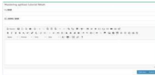
Figure 3. Display the Form Editor Menu

The appearance of this editor form menu contains an application mastering intended for the administration team to manage the contents of the material or video that will be displayed on the home menu.