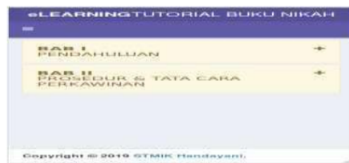
Figure 4. Display the Form Editor Menu

On this menu, display contains an electronic book pre-marital course material that is tailored to the syllabus and curriculum that applies to the ministry of religion