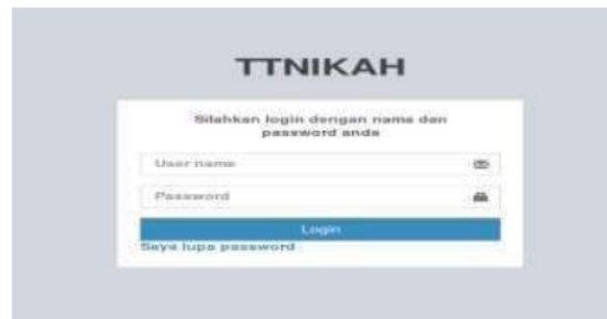
Figure 1. Login Menu

This display is intended for participants of premarital courses, pre-marital education speakers and premarital mobile learning application administrators by granting username and password permissions.